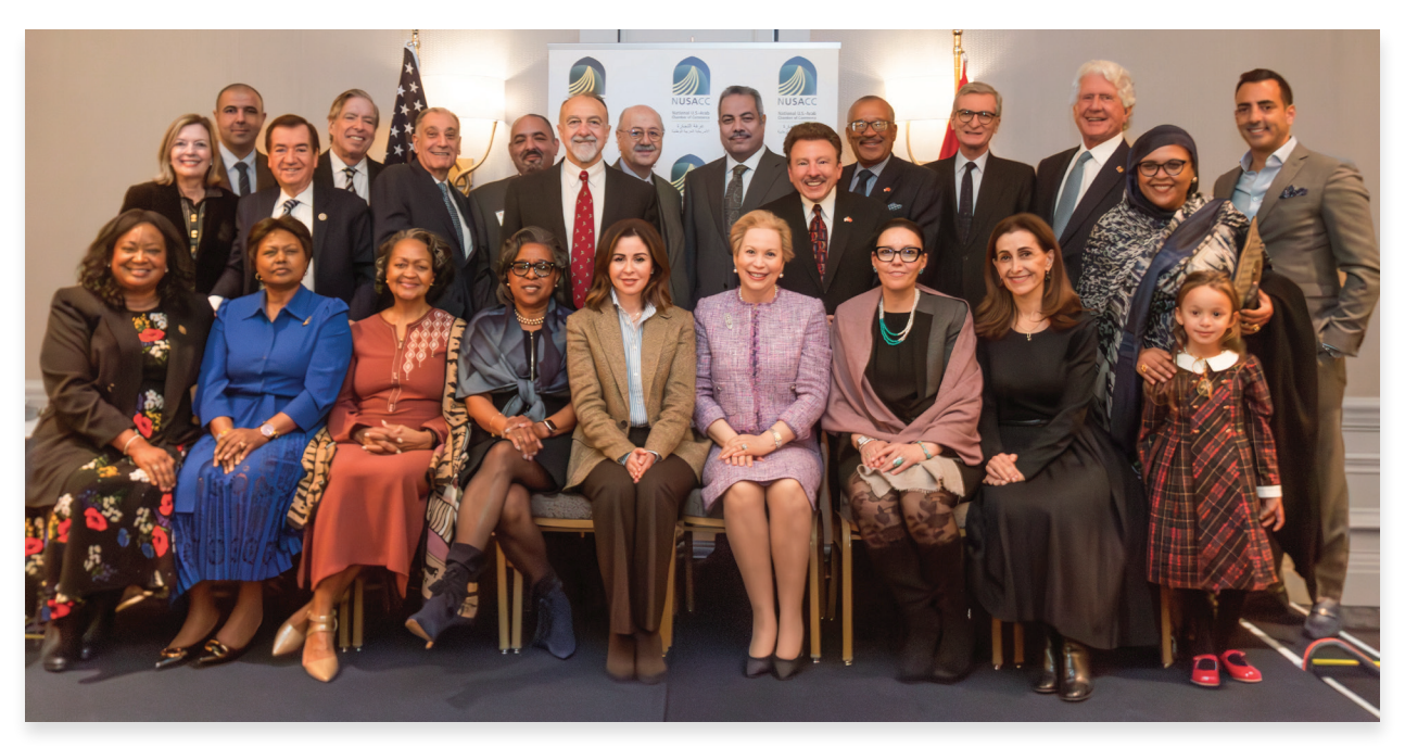
The Ambassador of the Year Award attracts high-level leaders from government, business, media, and the NGO community. Participating in this year's event were many senior diplomats, including nine current ambassadors from the Middle East and Africa.