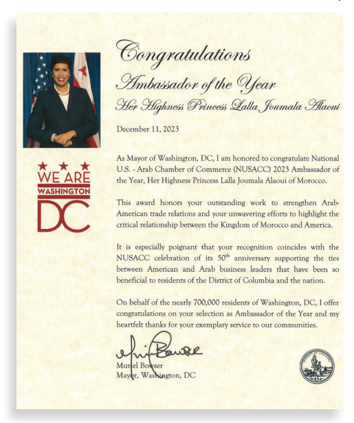
Citation from the Mayor of Washington DC, Hon. Muriel Bowser.

Because the FTA with the United States represents the "gold standard" of free trade agreements worldwide, the FTA has also helped to boost foreign direct investment (FDI) in Morocco. In 2022, the USA overtook France as the top foreign investor in Morocco, according to Morocco's Office des Changes, and U.S. investments there ($761 million) now account for more than 30 percent of foreign investments in the Kingdom. Morocco is experiencing a substantial increase in FDI in response to that nation's new Investment Charter, adopted at the end of 2022, which aims to reach 550 billion Dirhams (over $50 billion) of investment by 2026.