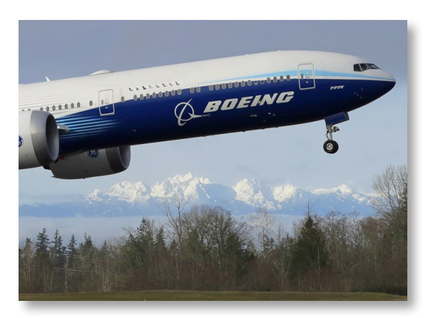
Boeing is America's top exporter.

The pandemic has been tough on Boeing, America's top exporter.