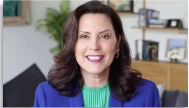
Hon. Gretchen Whitmer, Governor of Michigan, whose State contains the largest Arab-American community in the USA.

As Heritage Month winds down, a special event was organized on Sunday, April 25, to showcase Arab-American leaders and friends. The most prominent of these friends is Joe Biden, President of the United States, who sent a letter in support of National Arab American Heritage Month.