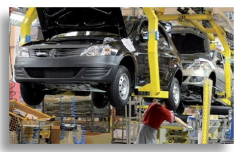
Renault factory, Tangier

During the Business Development Conference, to help highlight Morocco's commitment to the automotive sector, the Government of Morocco organized a site visit for delegates to Tangier Automotive City, Tangier Med Port, and the Renault facilities in Morocco.