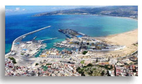
Tangier Med Port