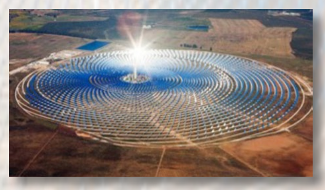
The Noor 1 solar power station, located in Ouarzazate, will soon be the world's largest concentrated solar power plant.

As part of its commitment to tap into renewable energy sources, Morocco has undertaken a vast wind energy program. The Moroccan Integrated Wind Energy Project, spanning a decade with a total investment of about $3.8 billion, will enable the country to bring the installed capacity from wind energy alone from 280 MW in 2010 to 2,000 MW by 2020.