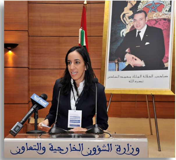
H.E. Mbarka Bouaida, Minister Delegate for Foreign Affairs and Cooperation: "Morocco has embarked on a path of reforms that has allowed our country to withstand the challenges of the Arab Spring, and we stand today as a model for the region."

Apropos of private sector cooperation, and in the context of guarantees offered to American investors by Morocco – U.S. Free Trade Agreement (FTA) provisions, she said, "U.S. Direct Investment in Morocco has grown from $27.27 million in 2005 to $286.4 million in 2014, with an average annual increase of 50.3 percent. This upward trend continued in 2015."