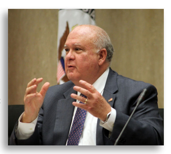
Hon. Joseph Westphal, U.S. Ambassador to Saudi Arabia

Westphal is bullish on the opportunities for U.S. businesses in Saudi Arabia, which is the second largest export destination in the Middle East and North Africa for the United States. (U.S. goods exports to the Kingdom increased by 5.27 percent in 2015, reaching nearly $20 billion.) "Now, you have a country looking at borrowing money, seeking more financing on projects from partners, competing more on price, and more energized to find cost savings wherever it can," he noted. "As Saudi Arabia diversifies its economy and tries to build manufacturing and attract more jobs, that will be in our interest."