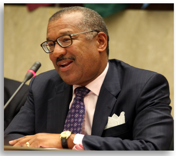
Hon. Dwight Bush, U.S. Ambassador to Morocco