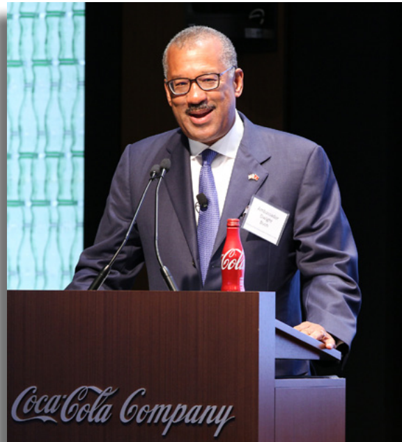
Hon. Dwight Bush, Sr., U.S. Ambassador to Morocco, highlighted Morocco’s role as a platform for U.S. business with the continents of Europe and Africa.

Africa and Sub-Saharan Africa and the benefits of maintaining an attractive business climate for investment in Morocco.”