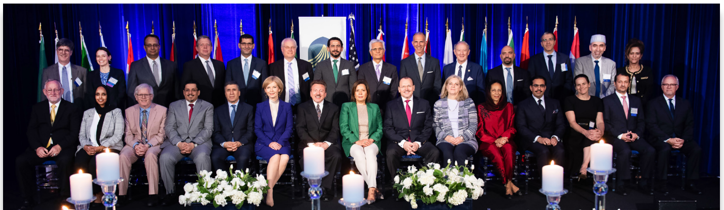
Senior Arab Embassy officials, U.S. Government representatives, business leaders, and Iftar sponsors from around the United States attended NUSACC's annual Ramadan Iftar .