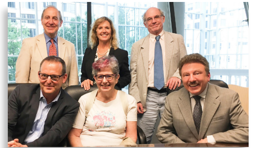
Leaders of the Overseas Americans Week delegation visited NUSACC.

June 10 (Washington, DC): As part of Overseas Americans Week , NUSACC hosted a delegation from the Association of Americans Resident Overseas (AARO) and the Federation of American Women’s Clubs Overseas (FAWCO) at NUSACC’s headquarters in Washington, DC. The delegation, as part of its annual “Doorknock” visit, met with dozens of policymakers to raise awareness about the priorities of Americans abroad, including the U.S. business community overseas.