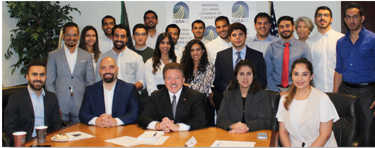
NUSACC leaders and professional trainers worked with PDI Fellows in 2019 to prepare them for one-year internships with U.S. companies. ( www.pdi-nusacc.org )