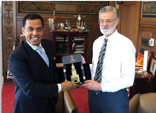
The Mayor of Cleveland, Hon. Frank G. Jackson, welcomed H.E. Hamad Al-Hazeem, Consul General of the State of Kuwait in New York.