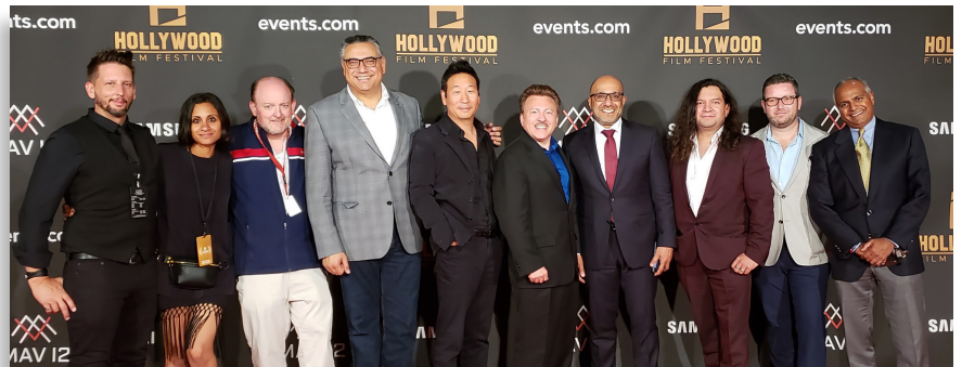
NUSACC’s David Hamod and leaders of the Hollywood Film Festival in California welcomed H.E. Faisal Al-Houli, Kuwait’s Consul General in Los Angeles.

October 5 (Los Angeles, California): NUSACC’s David Hamod and leaders of the Hollywood Film Festival in California welcomed H.E. Faisal Al-Houli, Kuwait’s Consul General in Los Angeles . The Hollywood-based film festival is exploring ways to raise the profile of young Kuwaiti filmmakers in the United States.