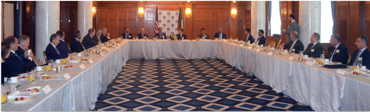
More than 30 high-level representatives from the United States and the State of Kuwait attended the roundtable at the Willard InterContinental Hotel.