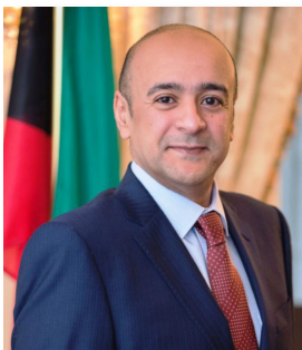
H.E. Jasem Albudaiwi, Kuwait’s Ambassador to the United States.

Sheikh Ahmed concluded, “Total consolidated assets at the domestic level reached KD 82 billion (US $266 billion) by the end of the first half of 2022. Credit facilities reached KD 44.7 billion (US $145 billion), with total deposits at KD 47 billion (US $152 billion), and total investments at around KD 8.1 billion (US $26 billion).”