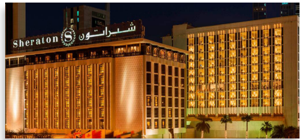
Sheraton Hotel in Kuwait.