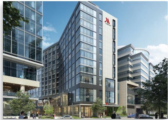
Marriott’s global headquarters in downtown Bethesda, Maryland.

“When we were talking to our customers, even pre-COVID, they were renting homes,” she said. “If they’re going to be doing that, let’s keep them in our ecosystem and in our Marriott family. So, in our case, over 90 percent of the people who rent homes on our Homes & Villas platform are Marriott Bonvoy members.”