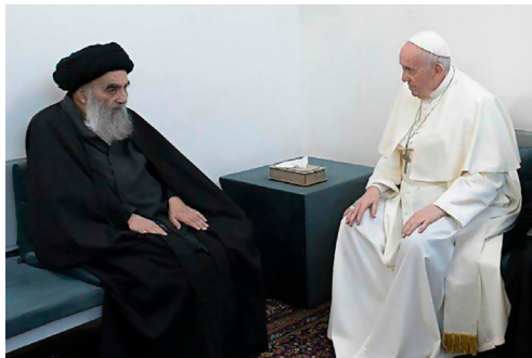
Grand Ayatollah Ali al-Sistani (left), meeting with H.H. Pope Francis in Najaf.