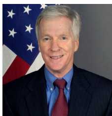
Amb. Ryan Crocker, former U.S. Ambassador to Iraq