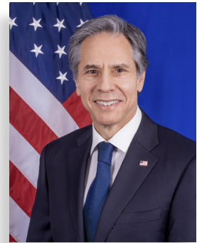
Hon. Antony Blinken U.S. Secretary of State.