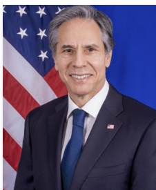
Hon. Antony Blinken U.S. Secretary of State

“In a way, this year’s sponsors represent a microcosm of modern Iraq,” noted NUSACC’s David Hamod. “Think of it this way: A nation founded on energy resources, growing steadily through trade and infrastructure development, with a focus on the nation’s youth as Iraq gradually transitions from a hydrocarbons-based economy to a knowledge-based economy.”