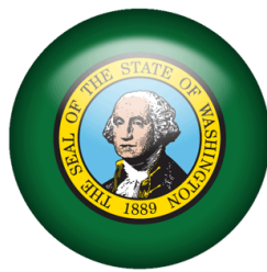
Washington $5.31 billion