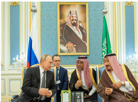
In October 2019, Custodian of the Two Holy Mosques King Salman bin Abdulaziz Al Saud met with Russian President Vladimir Putin at the Royal Palace in Riyadh.