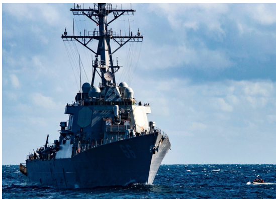
U.S. warship in the Arabian Gulf.