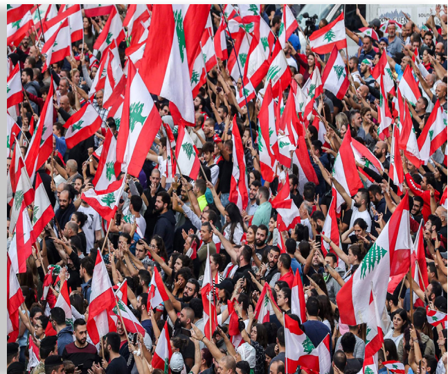
Protesters in Lebanon call for change.

Protests Across the Region – Around the region (and around the world), citizens are demanding more from their respective governments. In the Middle East and North Africa, this has resulted in widespread protests in Algeria, Iran, Iraq, Lebanon, Sudan, and other countries. These movements sometimes lead to improvements in political representation and qualities of life for local citizens, which can strengthen a nation’s economy. But in the short-term, such disturbances tend to stifle business, especially tourism. Capital is still a coward, and destabilized economies do not lend themselves to increased investment, free & fair trade, good governance, or efficient supply chains.