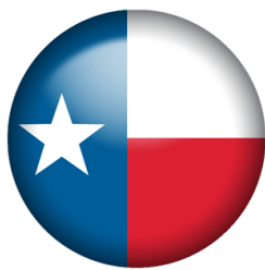
Texas $11.11 billion

Rounding out the top three exporting States was California , with $4.25 billion in exports to MENA, representing an increase of 3.55 percent from 2018 levels. California's leading sector has historically been agricultural products, accounting for a significant share of that State's goods exports to the Arab world.