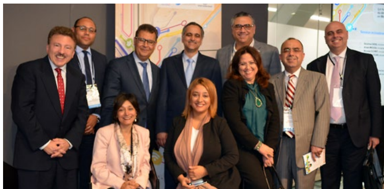
Some of the VIP delegates to the conference included senior government officials, business leaders, heads of NGOs, and World Bank representatives.