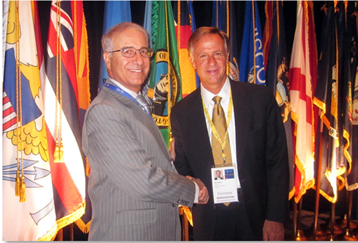
Tennessee Governor Bill Haslam (right), whose state hosted the NGA meeting, welcomes Moroccan Ambassador Rachad Bouhlal.

This year's visit placed a special emphasis on the Kingdom of Morocco, which was represented by H.E. Rachad Bouhlal, Morocco's Ambassador to the United States. "This is the second time that I have attended the annual meeting of the NGA," noted Ambassador Bouhlal, "and I thoroughly enjoyed making new friends and reaffirming existing friendships. Nowhere else in the United States can one meet with dozens of U.S. Governors in a single location like this, providing a unique opportunity to discuss business, but also to build personal relationships."