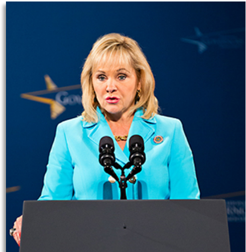
Oklahoma Governor Mary Fallin offers opening remarks at the NGA annual summer meeting, held this year in Nashville.