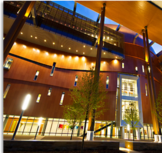
Nashville showed off its new Music City Center to meeting attendees.

The host state highlighted the musical heritage of Nashville, home of the Country Music Hall of Fame and Museum. These facilities house over two million Country Music artifacts, including possessions of such American icons as Elvis Presley, Johnny Cash, Dolly Parton, and a wide range of contemporary Country stars.