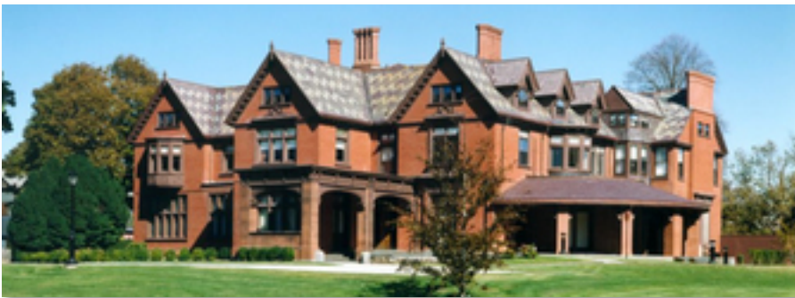
The U.S.-Arab Leadership Retreat was held at the Pell Center for International Relations and Public Policy, on the campus of Salve Regina University in Newport, Rhode Island.