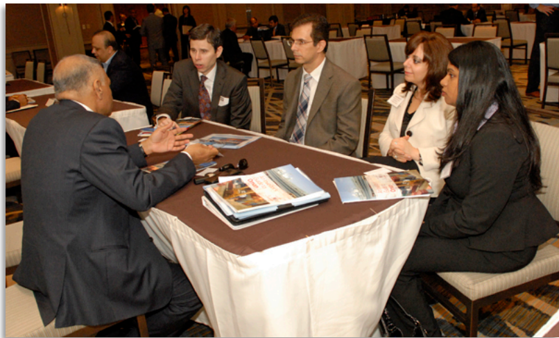
B2B meetings connected Omani and U.S. companies to explore business leads.

In Houston, Omani delegates met with dozens of U.S. companies in business-to-business (B2B) sessions. The delegates also visited the Port of Houston and some of the city’s top medical facilities, including such institutions as: Texas Medical Center, the largest medical center in the world; St. Luke’s Episcopal Hospital, part of a faith-based system with 87 hospitals; Texas Institute of Rehabilitation & Research, Memorial Hermann, a teaching hospital for the Baylor College of Medicine; Methodist Hospital, named among the country’s top hospitals in 13 of 16 specialties.