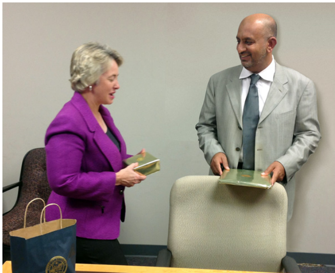
Hon. Annise Parker, Mayor of Houston, exchanges gifts of appreciation with H.E. Ali Al Sunaidy

Minister Al Sunaidy highlighted the important contributions in capacity-building provided by Occidental Petroleum (Oxy), which hosted the Omani delegation in Houston and served as a nationwide sponsor of the Road Show. Oxy employs over 2,000 Omanis, and the company provides extensive opportunities for professional development through training, internships, mentorships, career fairs, and support for Omani start-ups. Through its cross-posting initiative, Oxy brings some of Oman's best & brightest to the United States for intensive training and full immersion in the Oxy corporate culture. Minister Al Sunaidy described