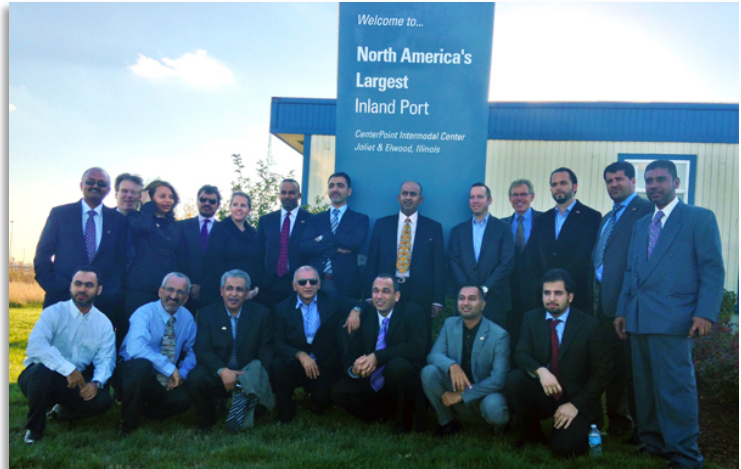
Delegates visited Centerpoint Intermodal Center, the largest master-planned inland port in North America.

The feeling was apparently mutual. Alderman Edward Burke, Dean of the Chicago City Council and Chairman of Chicago's powerful Committee on Finance, formally welcomed the Omani delegation to the Windy City. "A stable, thriving economy requires education and equality," he said, and "I applaud H.M. Sultan Qaboos bin Said for having the wisdom to mandate free and equal education for all Omanis, regardless of race, gender or religion." This commitment, he noted, will "come to represent the bedrock of your national identity. In a region known for turmoil, this is what will set you apart; education is what will define your future."