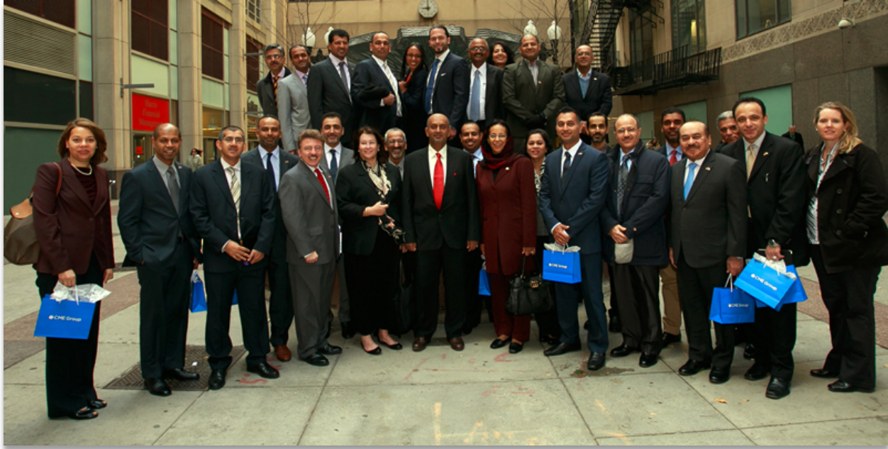
Oman Road Show delegates were treated to a VIP tour of the Chicago Board of Trade / Chicago Mercantile Exchange.

the city daily and supported by an average of more than 20,000 truck moves (i.e.- containers) every day.