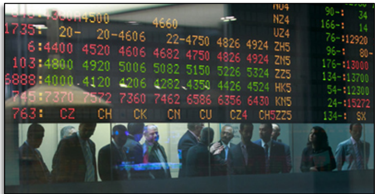
Omani delegates enjoy a bird's-eye view of the floor of the Chicago Mercantile Exchange.