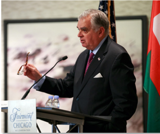
Hon. Ray LaHood, former U.S. Secretary of Transportation: "You have a great vision that will pay huge dividends."

composed of more than 40 business leaders, representing many of the top companies in Oman, as well as a handful of small and medium-sized enterprises (SMEs). The Road Show is being organized by the National U.S.-Arab Chamber of Commerce.