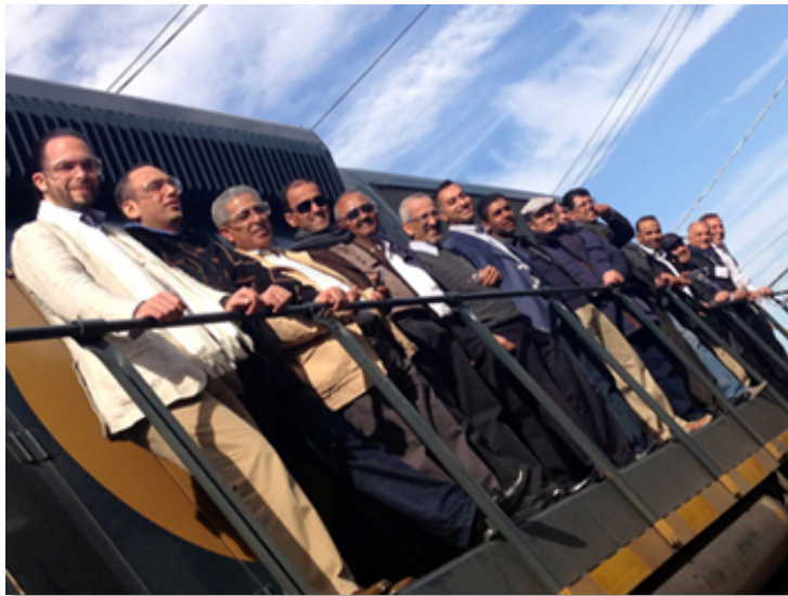
Wabtec Corporation manufactures a broad range of products for locomotives, freight cars, and passenger vehicles.