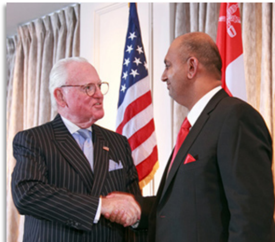
Hon. Edward Burke, Dean of the Chicago City Council, welcomes H.E. Ali Al Sunaidy, delegation leader and Oman's Minister of Commerce & Industry.

Mayor Emanuel concluded, "Chicago's place as an international hub, coupled with its vast experience in transportation, tourism, healthcare and manufacturing, positions this road show to propel more involved collaborations between our countries."