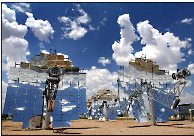
Algeria's Solar Breed Project is a joint Algerian-Japanese university endeavor with a goal of providing 50% of the world's solar energy by 2050.