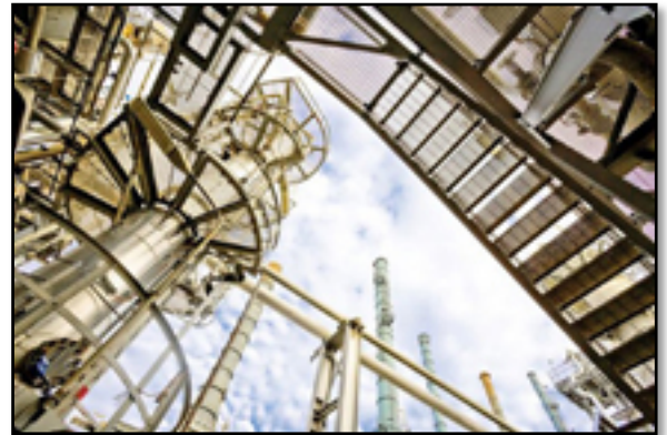
Tamakul and Oman Oil are investing over $7 b. in expansion of the Duqm and Sohar Refineries.