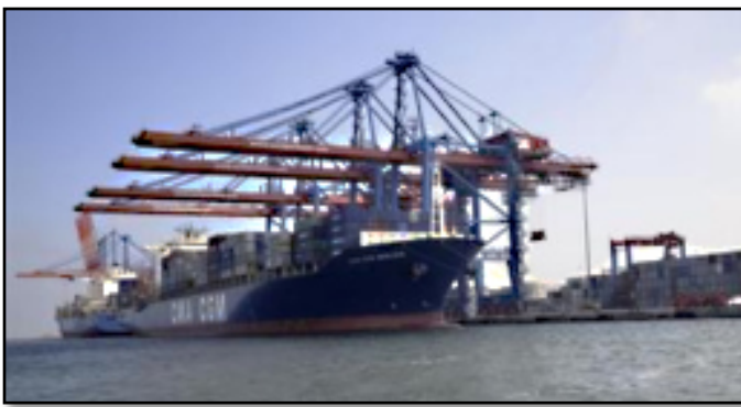
Egypt's Safaga Port is a strategic project that will create an oil & gas hub for the region.

Egypt , 97 percent of which is uninhabited, according to Commercial Counselor Mohamed El Khatib, offers remarkable opportunities for infrastructure development. Much of this work is overseen by the government’s Public – Private Partnership Unit, which works to facilitate cooperative projects. Egypt has dozens of projects in the works, with a special focus on quality of life initiatives for its burgeoning population of more than 80 million people: power, water, hospitals, schools, transportation, thoroughfares, and the like. The Safaga Industrial Port, for example, is a high profile project intended to create an oil & gas hub for the region. With Egypt’s multi-lingual society, Business Process Outsourcing (BPO) and call centers are important employment drivers, generating more than 40,000 jobs.