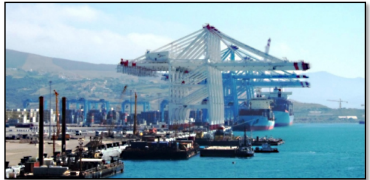
The Port of Tangier in Morocco will soon be the largest port in the Mediterranean.

* Logistics – The Port of Tangier, soon to be the largest in the Mediterranean, will be able to handle 9 million containers per year after expansion. The port recently received the CMA CGM Marco Polo, the world's largest container ship by capacity (18,000 containers and up to 16,020 TEUs).